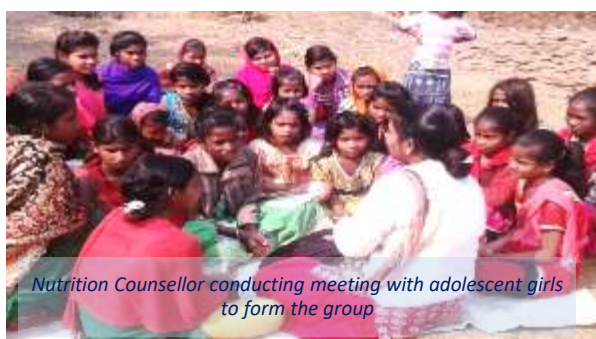
Nutrition Counsellor conducting meeting with adolescent girls to form the group