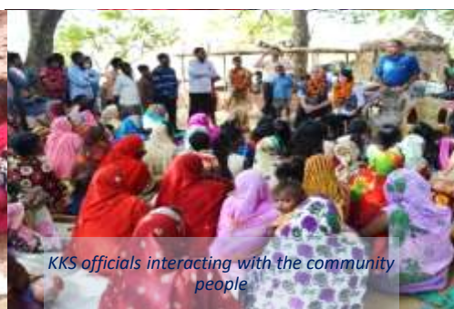
KKS officials interacting with the community people