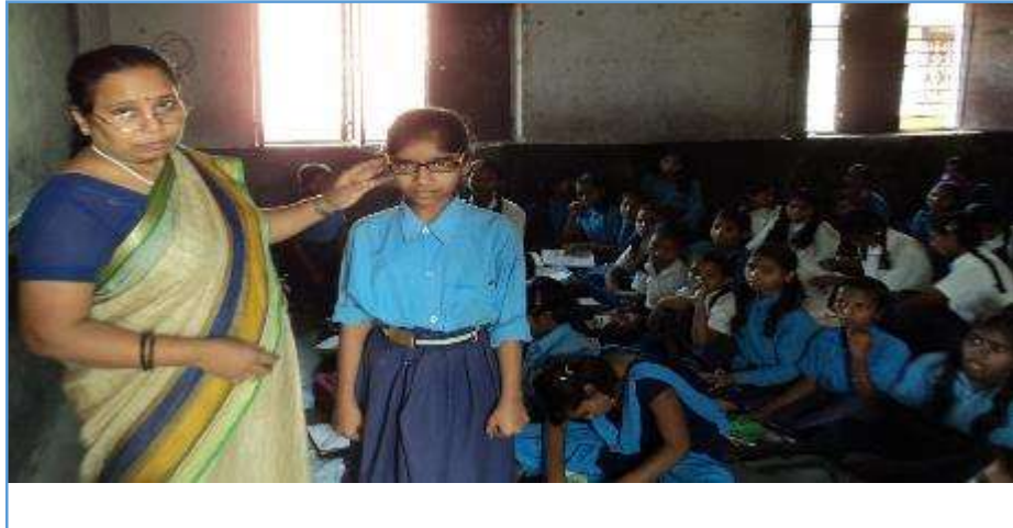
Spectacles distribution among children at Kanya Middle School, Dighatghat